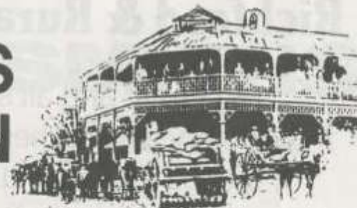
SCOTTS TAVERN 1903